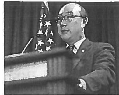
( http://stmedia.startribune.com/images/ows_14859247239883)

Prescription painkillers have been blamed for starting the opioid epidemic and driving those addicted to illegal street drugs such as heroin. A Star Tribune analysis of state death certificate data found 402 opioid-related deaths in Minnesota in 2016, up from 344 in 2015 and more than double the number in 2006.